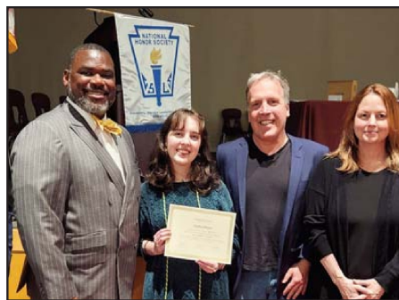
(Photo, left) On Thursday, April 25, 2024 at the Windsor High School National Honor Society 67th Annual